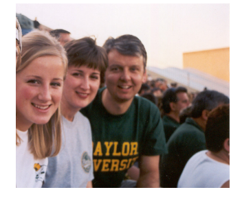
Parent's weekend at Baylor

He has continued his love of music – he's still playing the guitar mostly, but also continuing with the drums and piano from time to time. As a junior, he is contemplating what college to attend.